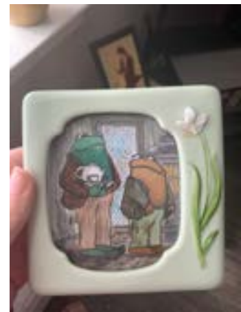
Two examples of Katie's beautiful paintings in lovely, thrifted frames and inspired by Beatrix Potter and Frog and Toad