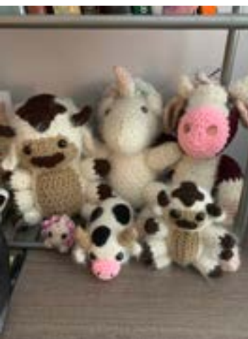
Several examples of Katie's crocheted stuffed animals, including an adorable goose named Lily