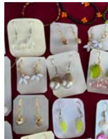
A closer look at Katie's jewelry, including acorn earrings made from actual acorn shells