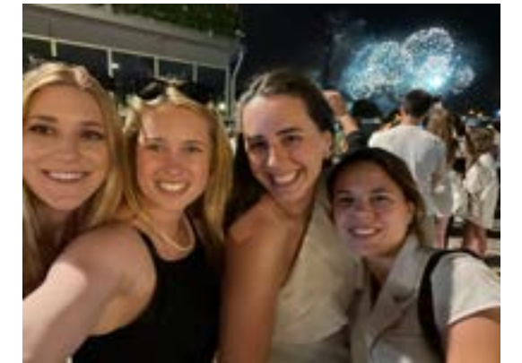
Presley still keeps in touch with many of the friends she met during the study abroad program, and they have been extremely helpful with LSAT study tips, law school application questions, and general support.