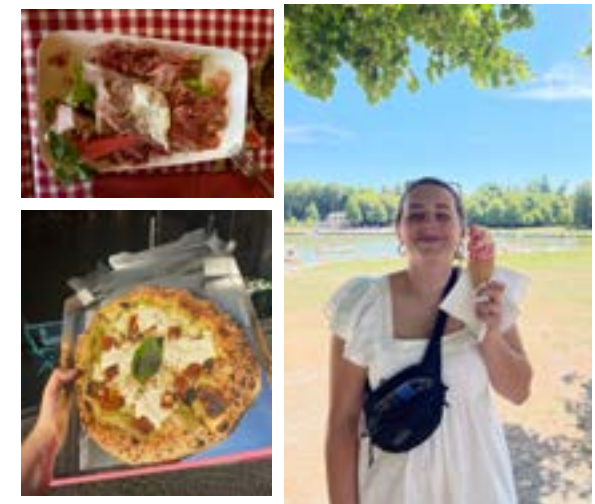
One of the best parts of her time abroad was the amazing food!